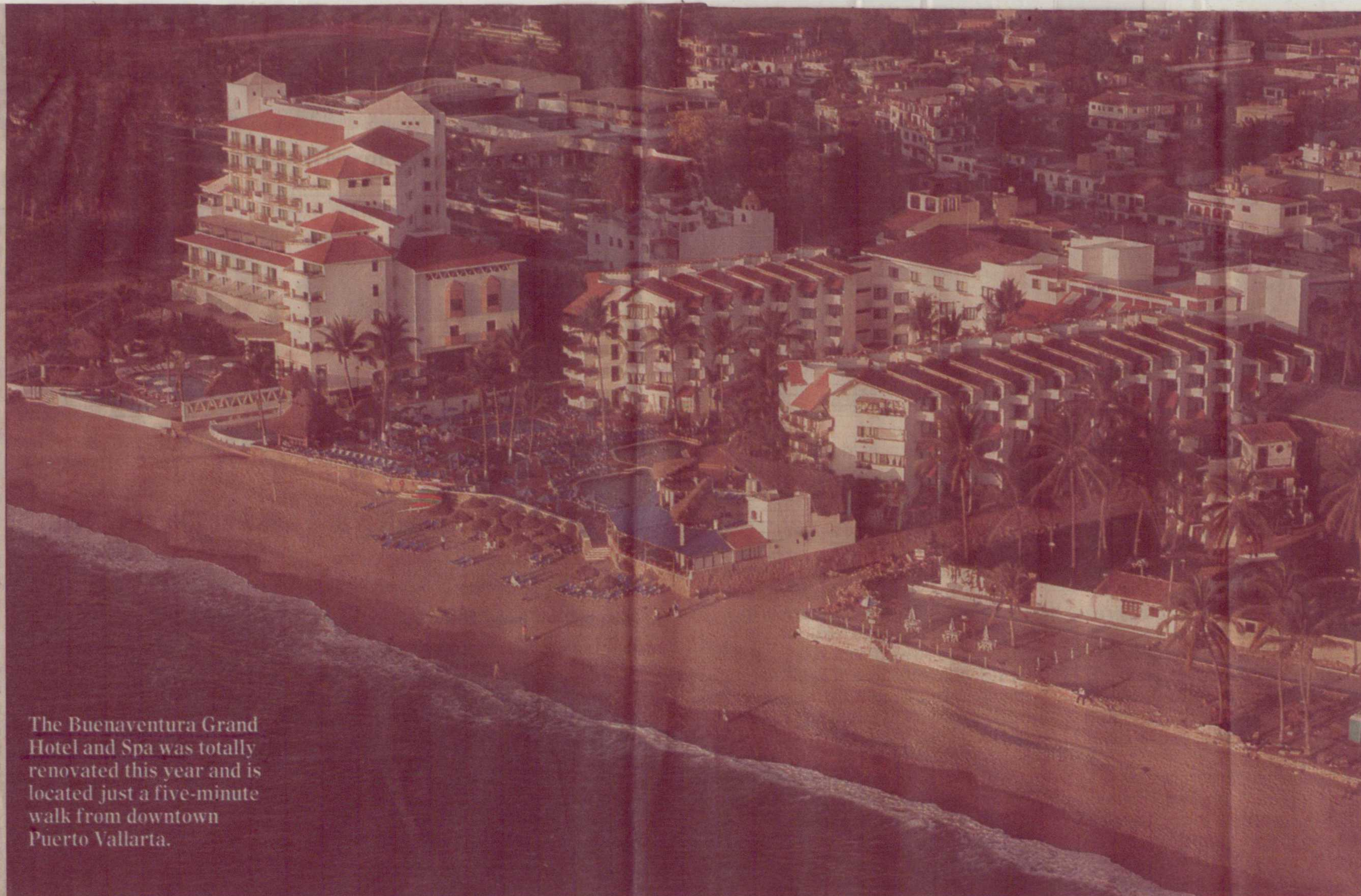
The Buenaventura Grand Hotel and Spa was totally renovated this year and is located just a five-minute walk from downtown Puerto Vallarta.